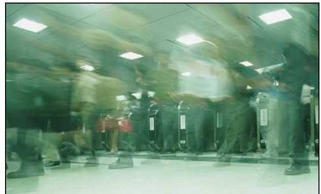
Neckloop-PTT for covert communication

Purpose-built for both, semi covert and covert use, this rugged and most flexible induction set is to operate with almost any kind of analogue or digital radio. The send button with integrated microphone is fixed on the neckloop. The set furthermore provides two jack ports, to add external accessories. This ensures a multi-purpose way of communication.