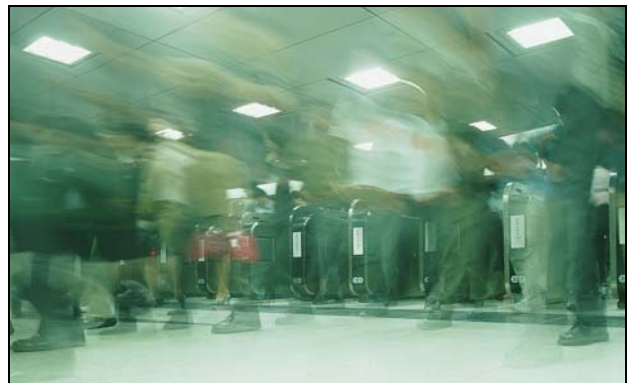
Neckloop-PTT for covert communication

Purpose-built for both, semi covert and covert use, this rugged and most flexible induction set is to operate with almost any kind of analogue or digital radio. The send button with integrated microphone is fixed on the neckloop. The set furthermore provides two jack ports, to add external accessories. This ensures a multi-purpose way of communication.