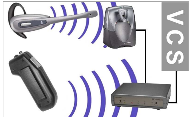
Functionality of the IFB-REVARIO linked to a VCS

The IFB-REVARIO is an add-on product to enable wireless radio communication in connection with a "Voice Communication System" (VCS). Consisting of the wireless send button PTT-13WL and the IFB Box, you can add any kind of wireless headset that features a "push-to-talk" (PTT) function to enable wireless communication in dispatch stations, Control Centres and ATC area. One IFB-Receiver can have assigned up to 4 Send buttons.