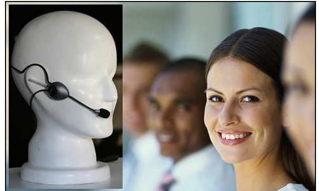
How to wear / use in call centre

The BusinessLine NBS is a lightweight monaural neck holder headset. The innovation of wearing it around the neck is especially developed for the professional use in call centres. The outstanding characteristic of the BusinessLine NB series is the connection to the earlap, called Open-Ear-Gain Technology, well known in the industry of hearing aids.